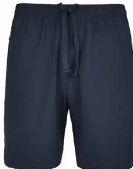
1111569 Microfibre Sport Short