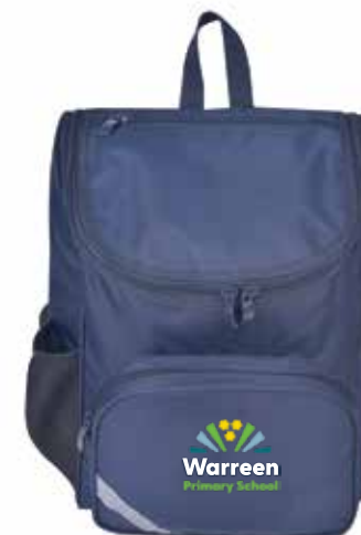
8362220_12 - INK Junior Backpack