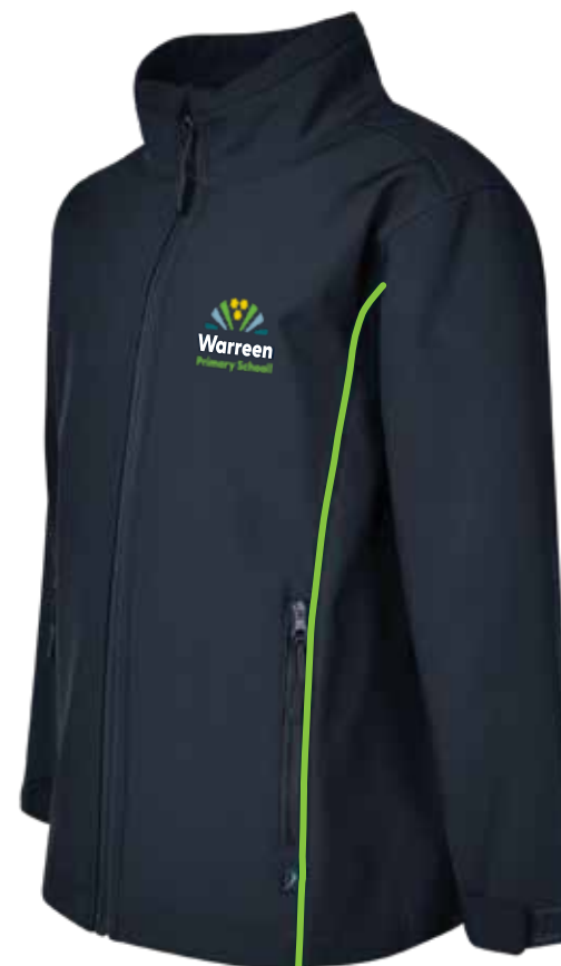
1118334 - Ink_Jasmine Bonded Jacket - Contrast piping

Date: _____ Signature: _____ Name: _____ Position: _____