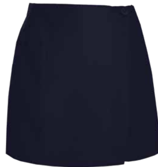
1100375 Microfibre Sport Skort

Date: _____ Signature: _____ Name: _____ Position: _____