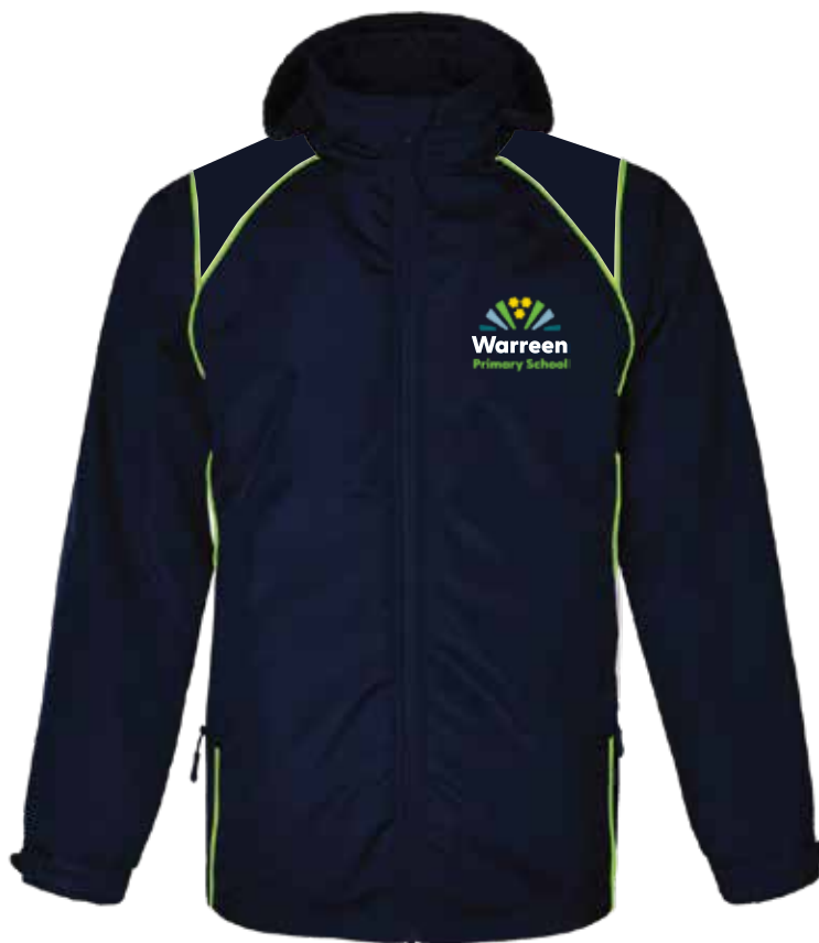
1118332 Fleece Lined Hooded Spray Jacket with contrast piping