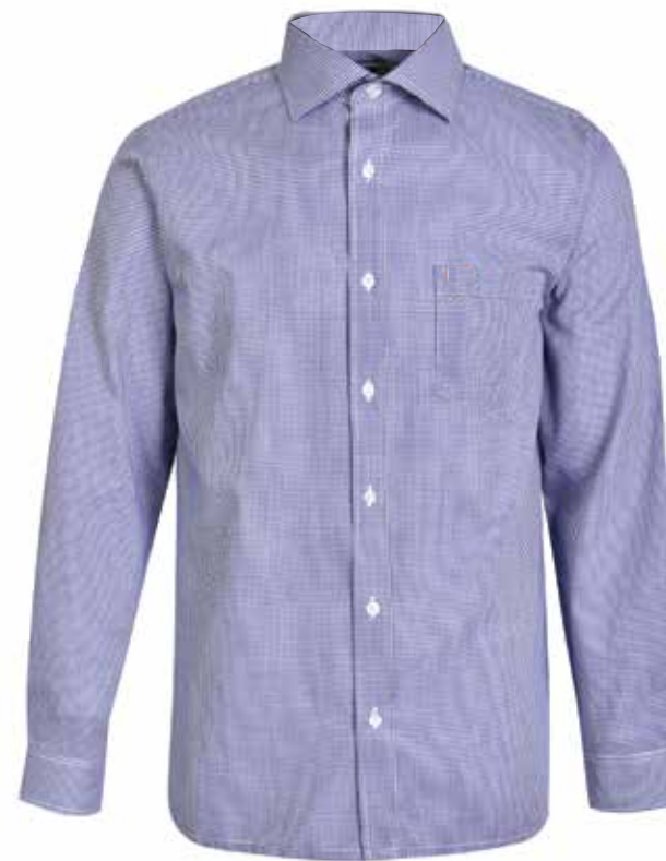
1167301_2674 SS Formal Shirt w Inner Contrast Collar

Date: _____ Signature: _____ Name: _____ Position: _____