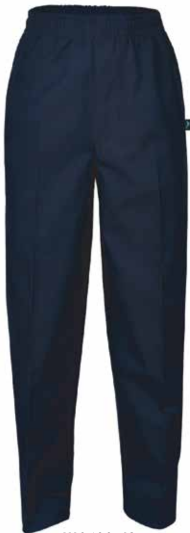
1110400_12 Elastic Waist Pants - Yoke Back