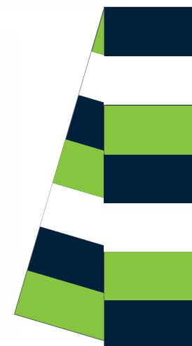
Custom Scarf INK/JASMINE/WHITE

Date: _____ Signature: _____ Name: _____ Position: _____