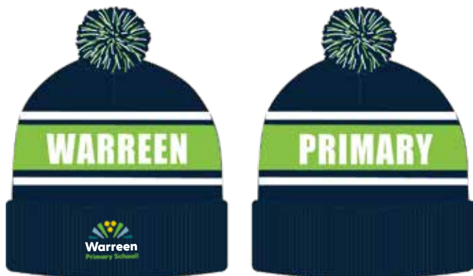
Custom Jacquard Beanie with Pompom INK/JASMINE/WHITE