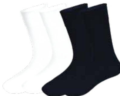
2511050 Crew Socks 3 pack - WHITE/NAVY