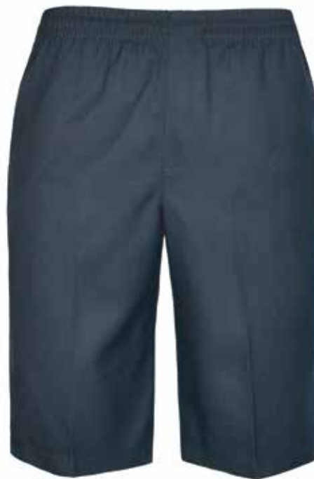
1110360_12 Elastic Waist Shorts - Yoke Back

Date: _____ Signature: _____ Name: _____ Position: _____