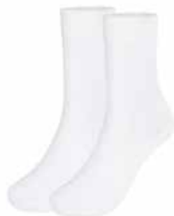
2511000_14 Turnover Ankle Socks WHITE