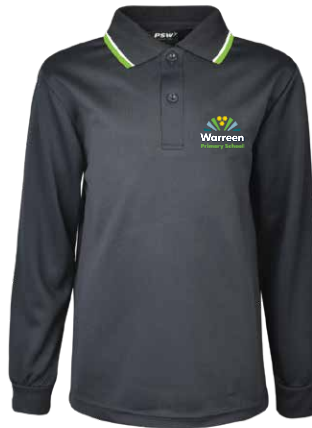
1118375 LS Polo with Contrast Collar Tipping

Date: _____ Signature: _____ Name: _____ Position: _____