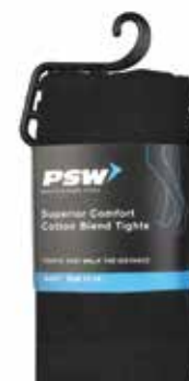
2513000_1 - Navy Cotton Blend Tights