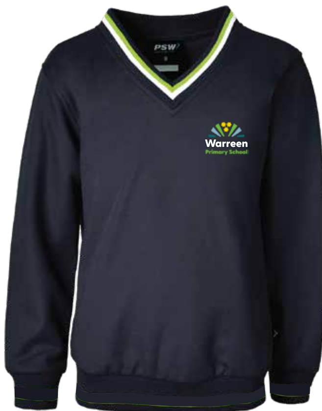
TBC (Based on 1111165) Tracksuiting V Neck Jumper w Contrast Stripe Rib