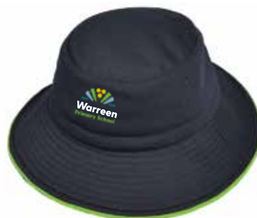
1100593 - Ink_Jasmine Adjustable Mesh Bucket Hat - Contrast Piping