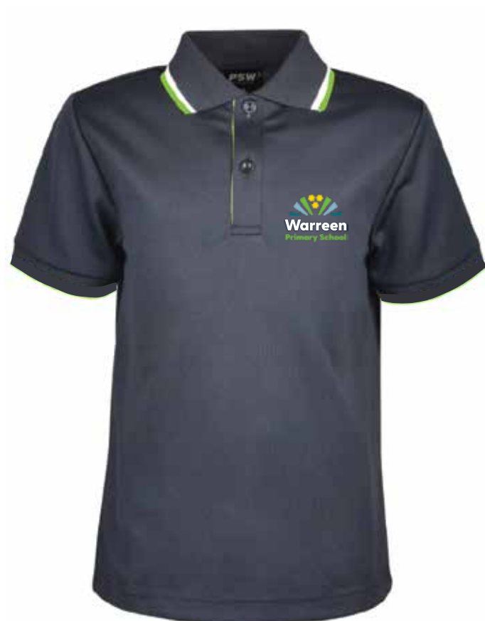
1118355 SS Polo with Contrast Collar Tipping