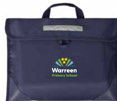
8300396_12 - INK Primary Pete Bookbag