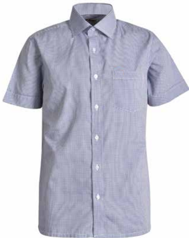
1167300_2674 SS Formal Shirt w Inner Contrast Collar