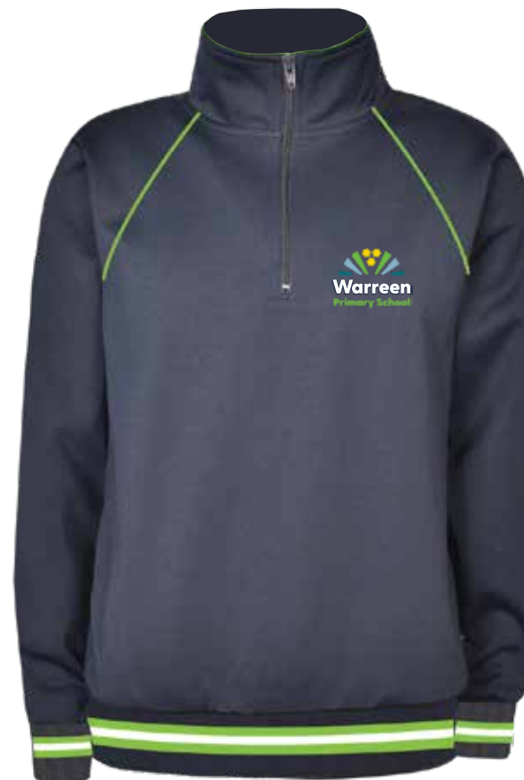
1167011 1/4 Zip style Pullover with classic contrast striped rib.

Date: _____ Signature: _____ Name: _____ Position: _____