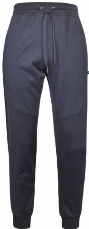
1167401 Tracksuiting fabric Double Knee Pant with elastic cuff